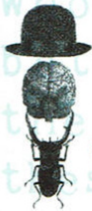
BeetleBrainBowler Plate 3 in a series of 5